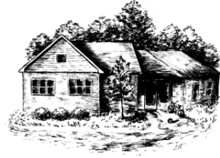
HomeStart Drawing by Former Resident