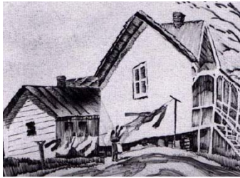
Rural Winter Scene by Ernest Craig