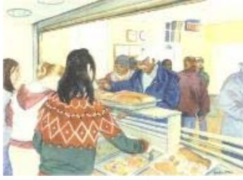
Community Kitchen